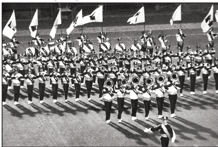
The Hurricanes on June 16, 1973.