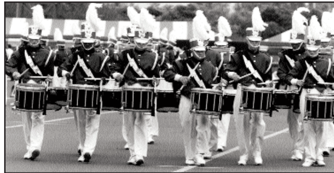
(Above) The Connecticut Hurricanes, 2000 at DCA Prelims in Scranton, PA; (below) the Hurricanes on June 22, 2002.