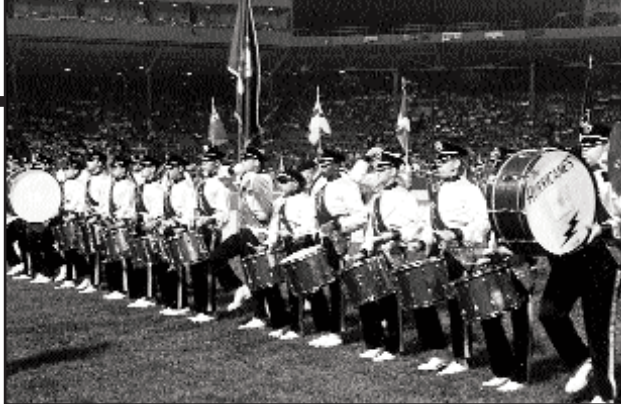
The Hurricanes at the 1967 American Legion Nationals in Boston, MA.

Syracuse contest, which was the second of only two losses suffered by the Hurcs that year. The corps earned nine show titles, took top honors at Mission Drums, Barnum