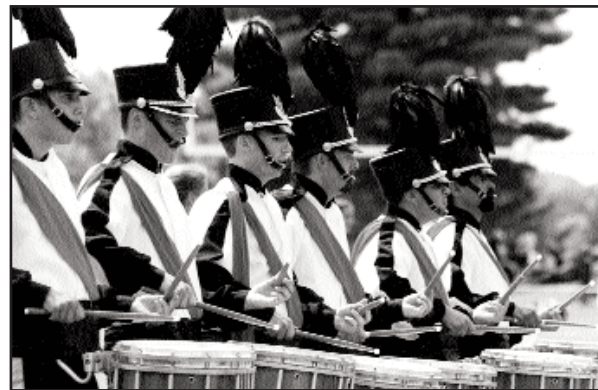
The Hurricanes on August 30, 1997 at the DCA Championship Prelims.

an original member of the John H. Collins Fife, Drum and Bugle Corps. He was a fife player in the original group and went on to become honor guard captain for the Hurricanes.