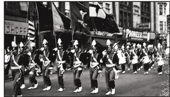
The Hurricanes in 1955.