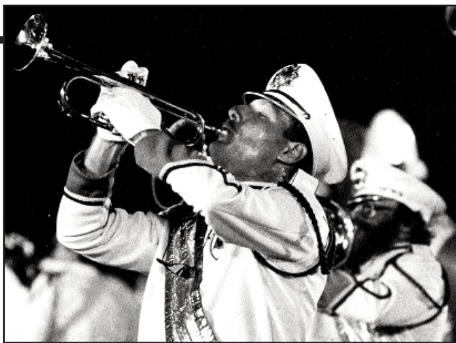
The Hurricanes on August 24, 1985 at Montclair, NJ