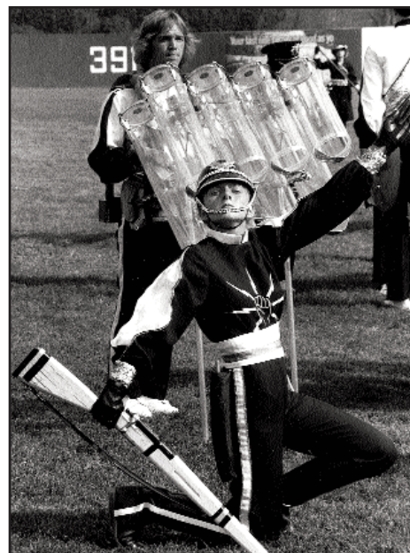
(Above) The Hurricanes in 1979; (below) the Hurricanes on June 5, 1976.