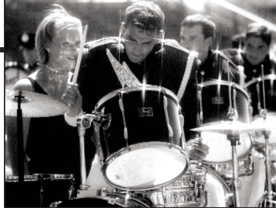
The Connecticut Hurricanes on September 5, 1998 at DCA Prelims in Scranton, PA.