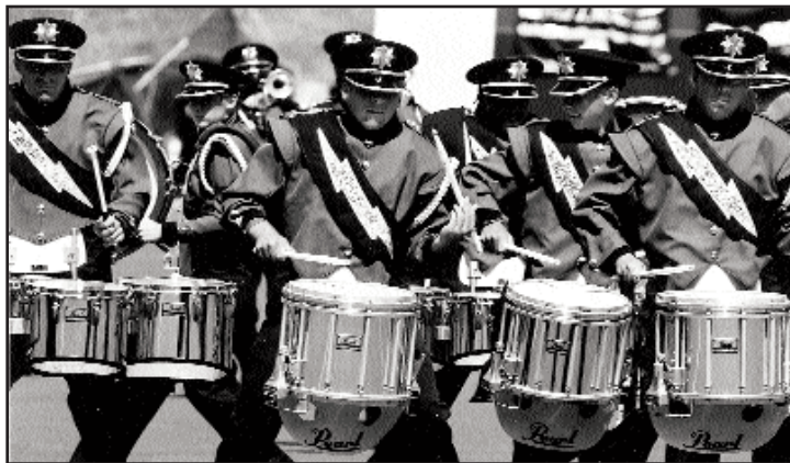
The Connecticut Hurricanes, 2002, at DCA Prelims in Scranton, PA.

He especially wants to thank his wife who he met in 1967 while she was marching in a drum corps color guard in New Jersey called the Imperial Knights, for her support.